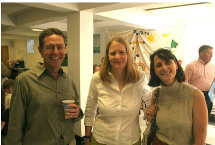
A good time was had by all at the annual religious education brunch