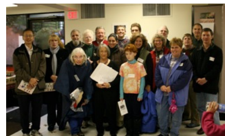
A few Oldtown Photographers at the October 18 Photo Show!